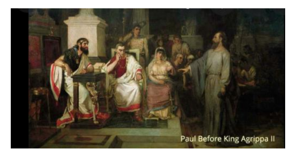
Paul's Defense before Agrippa"