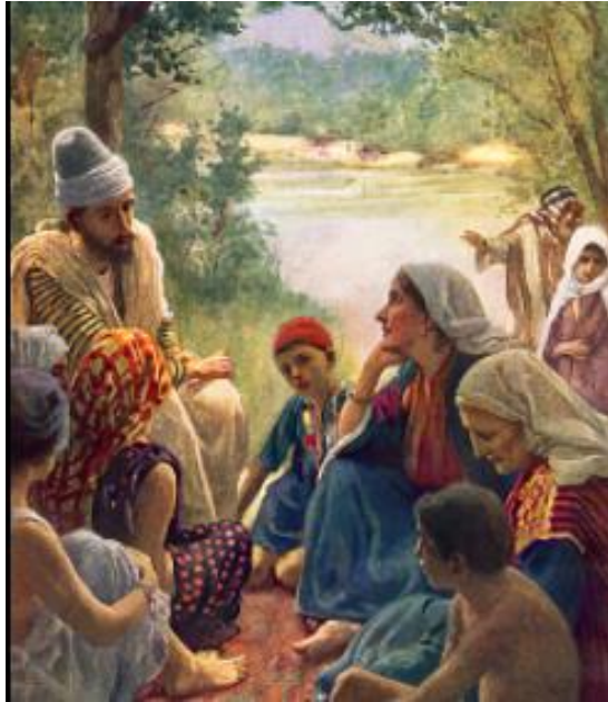
Harold Copping – Lydia of Thyatira