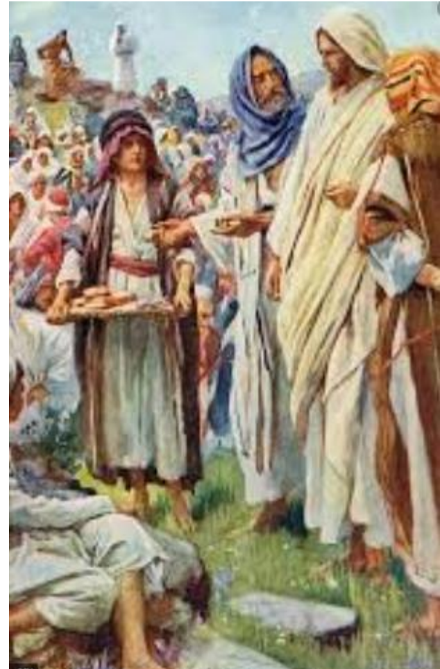
Feeding of the Five Thousand