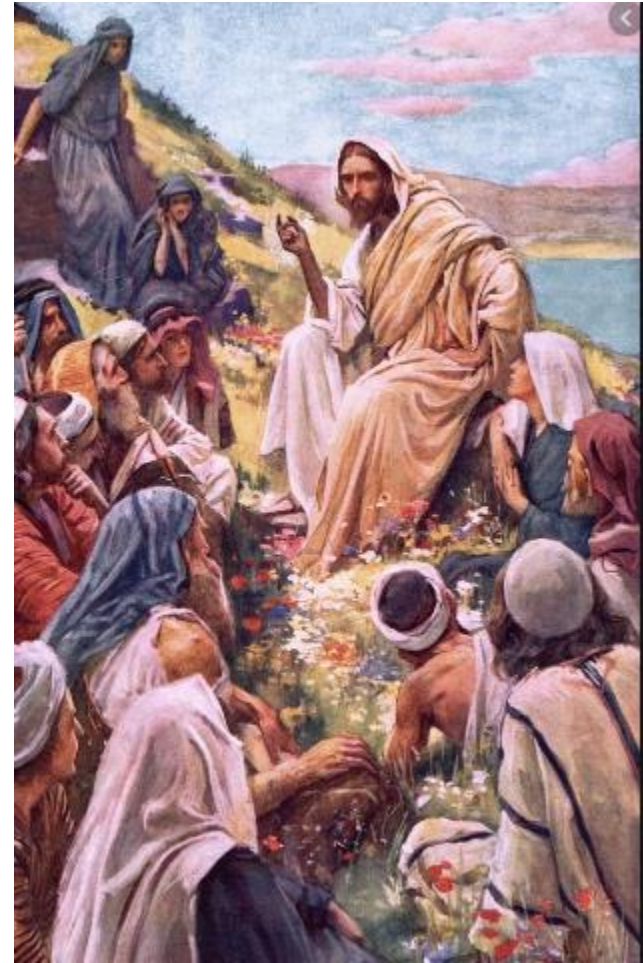
The Sermon On The Mount

https://www.youtube.com/channel/UCX_eiaOaX9-7cSZLS_u0DGw/videos?disable_polymer=1