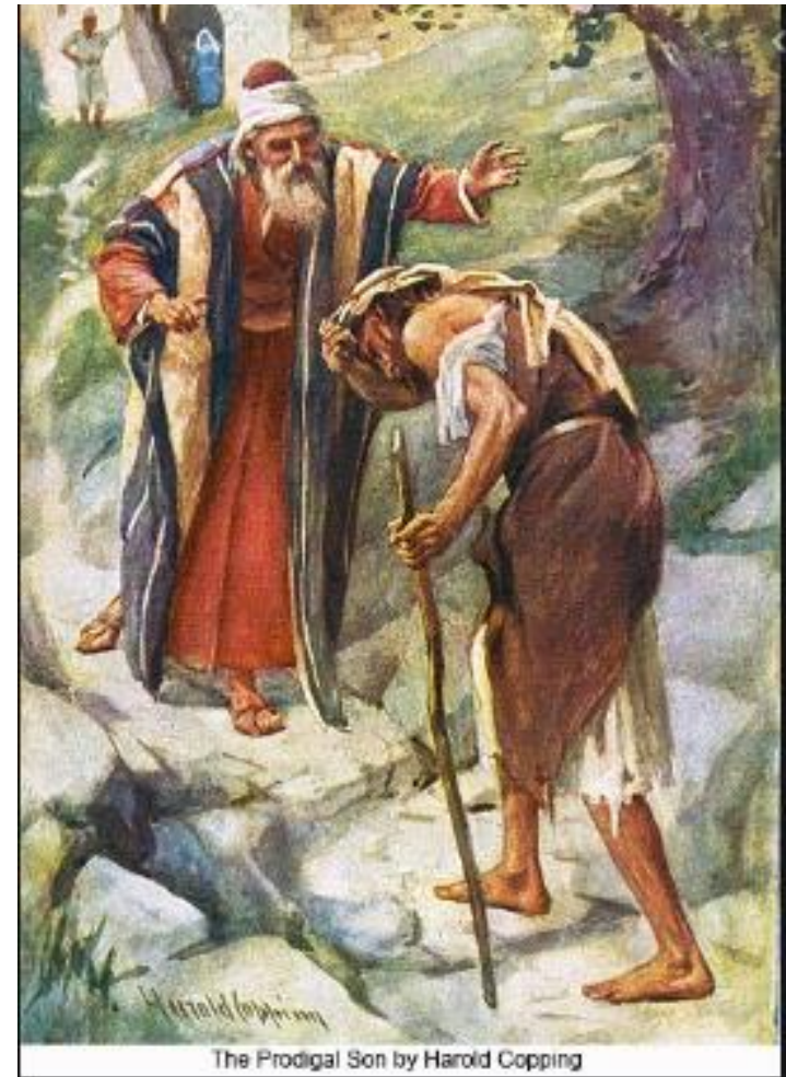
The PRODIGAL SON