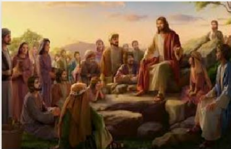
Beatitudes – Bible Story